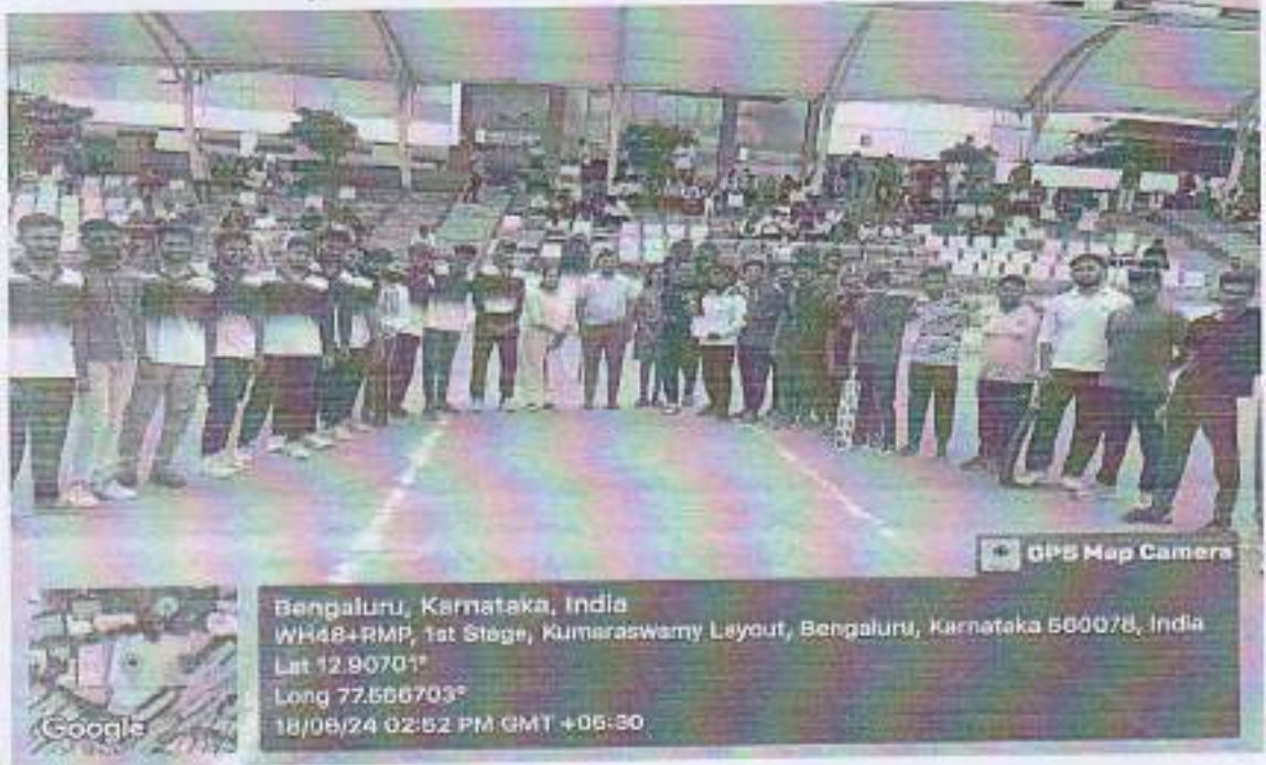
Final teams of Cricket Boys.