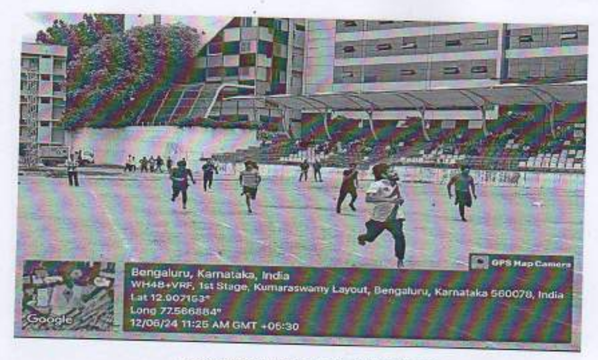
Students are participating in - 100 Mt (BOYS)