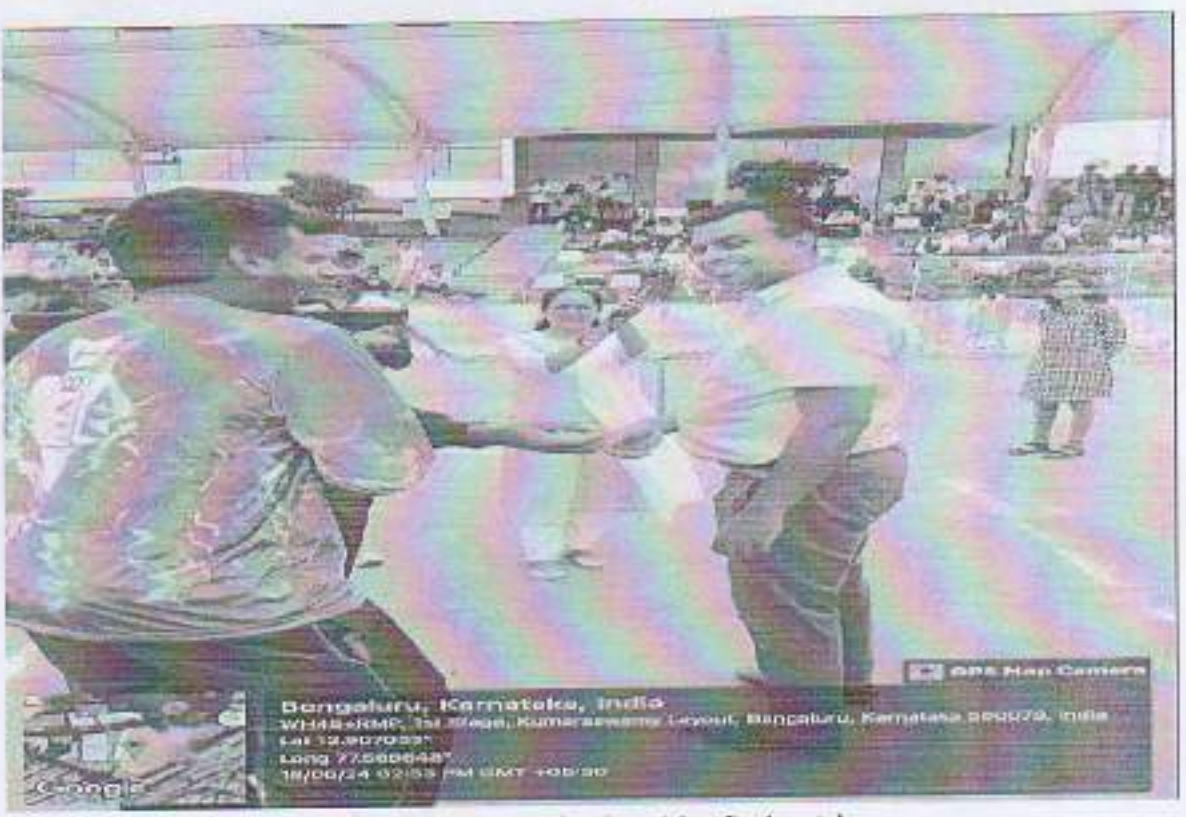
CRICKET BOYS -Toss for the cricket final match.