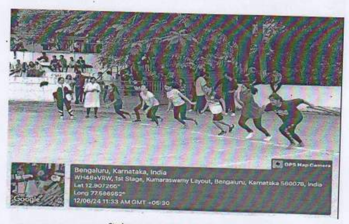
Student are taking part in 100 mt (GIRLS)