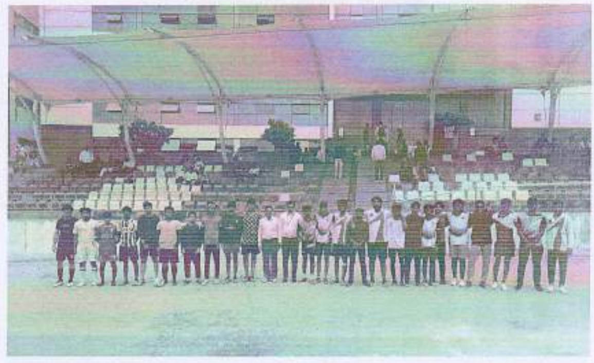
FOOT BALL BOYS TEAM