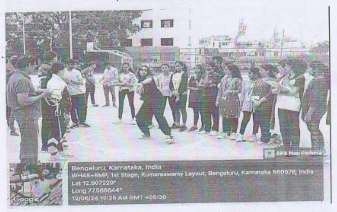
Girls Students are taking part in SHOT PUT