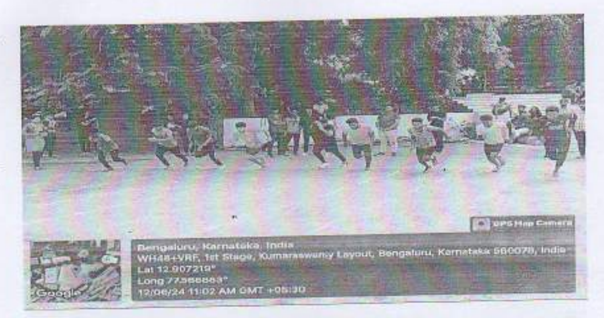
Boys students are taking part in 200 mt.