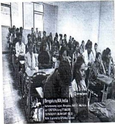
Picture-2 Resource person interacting