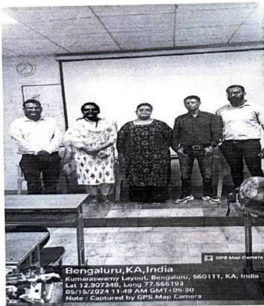
Picture 4 another resource person interacting with students