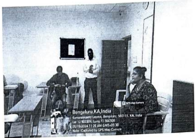
Picture 3 Resource persons and the faculty incharge