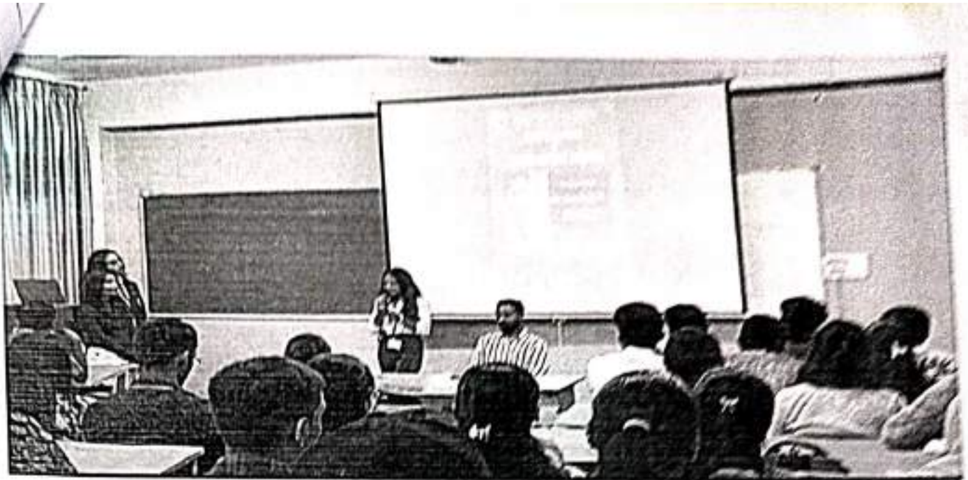
Pic 1 - Introducing to the Guest speaker