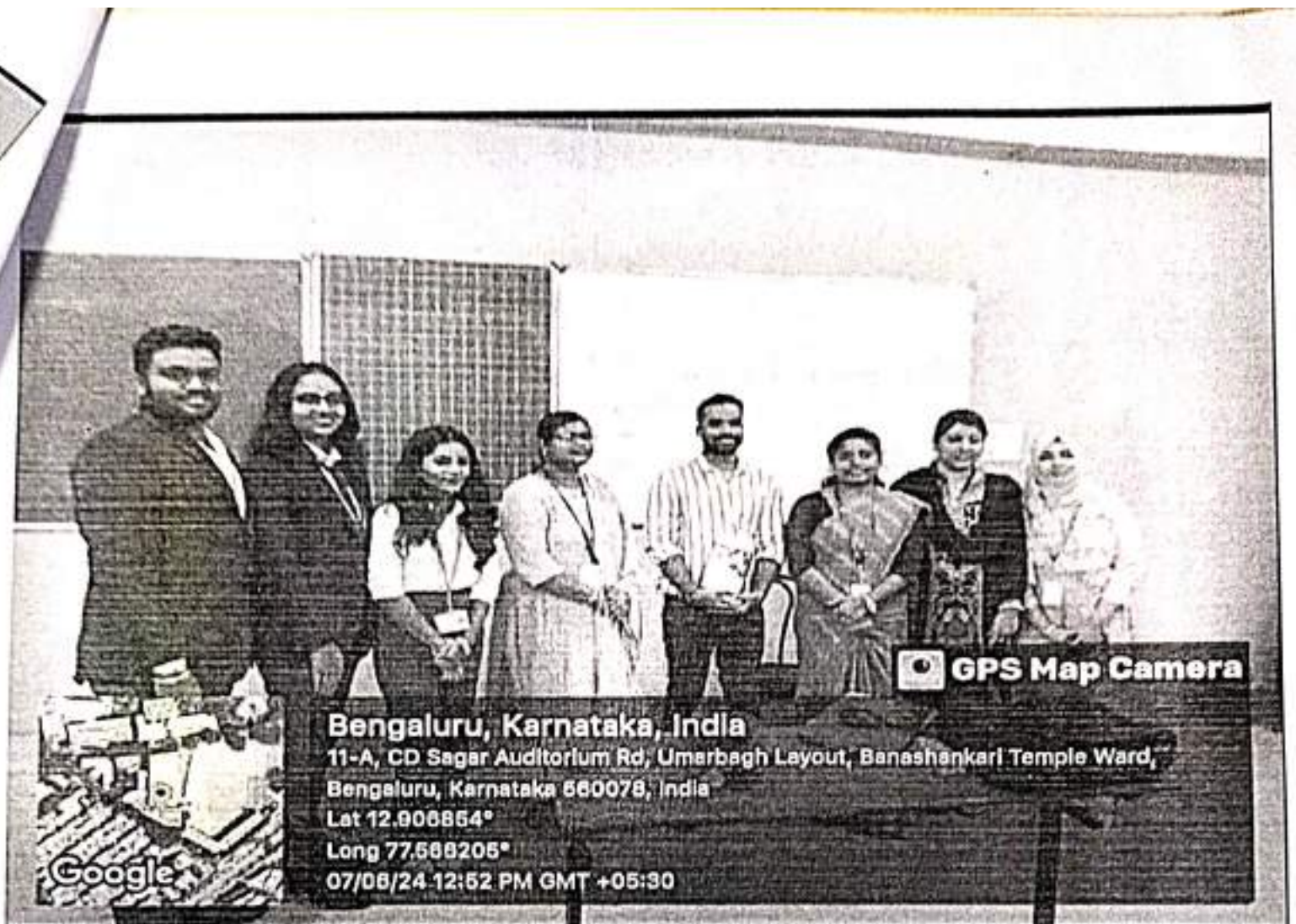
Pic 5-Faculty organizers and Student volunteers along with Guest Speaker