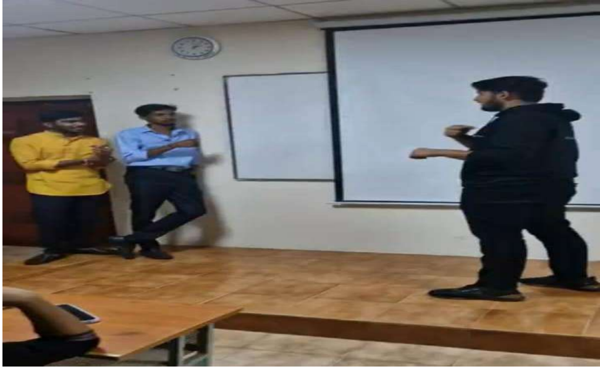
TEAM NO-1 – B.COM 3 RD SEM STUDENTS