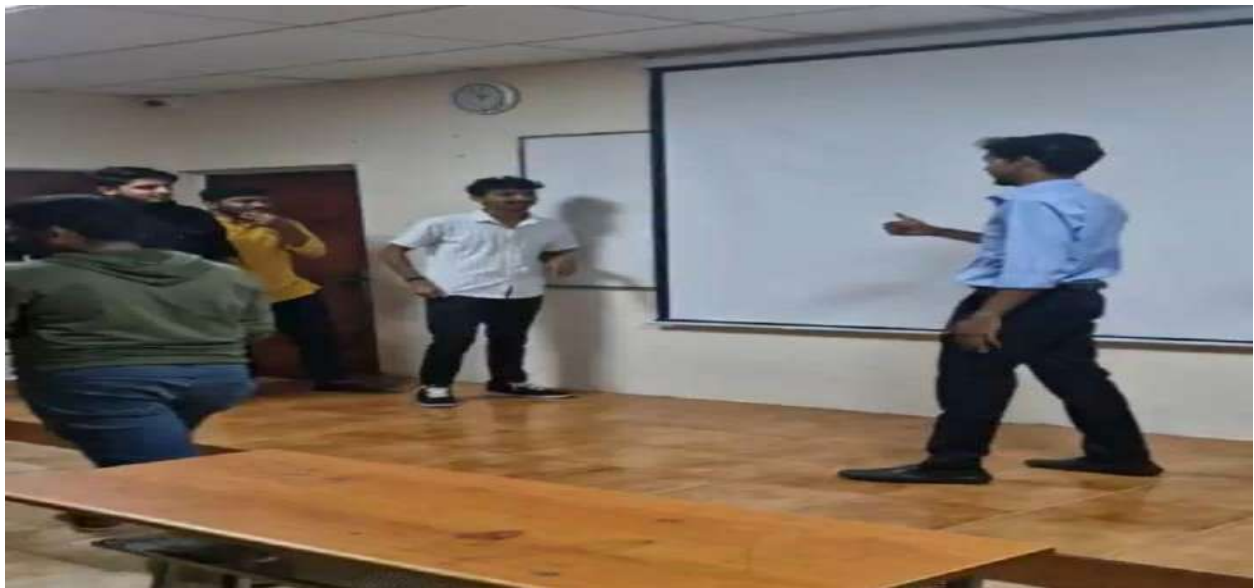
TEAM NO-4 – B.COM 1 ST SEM STUDENTS