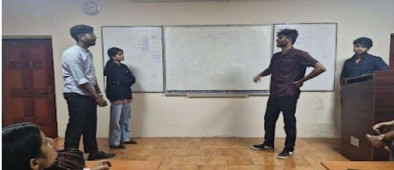
TEAM NO-3 – B.COM 3 RD SEM STUDENTS