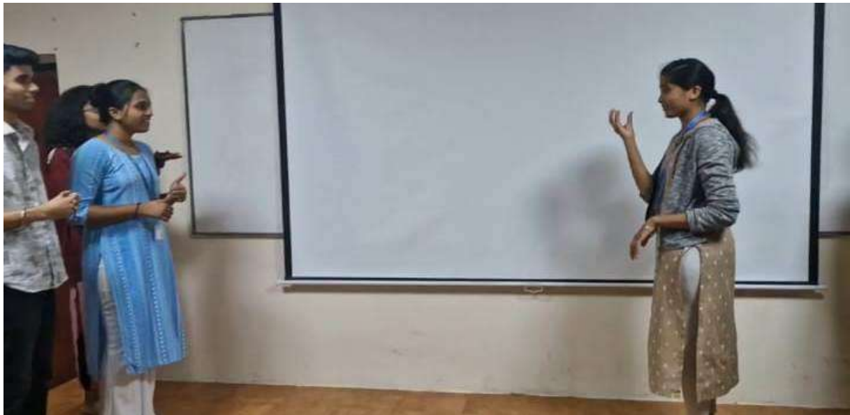
TEAM NO-2 – B.COM 3 RD SEM & 1 ST SEM STUDENTS