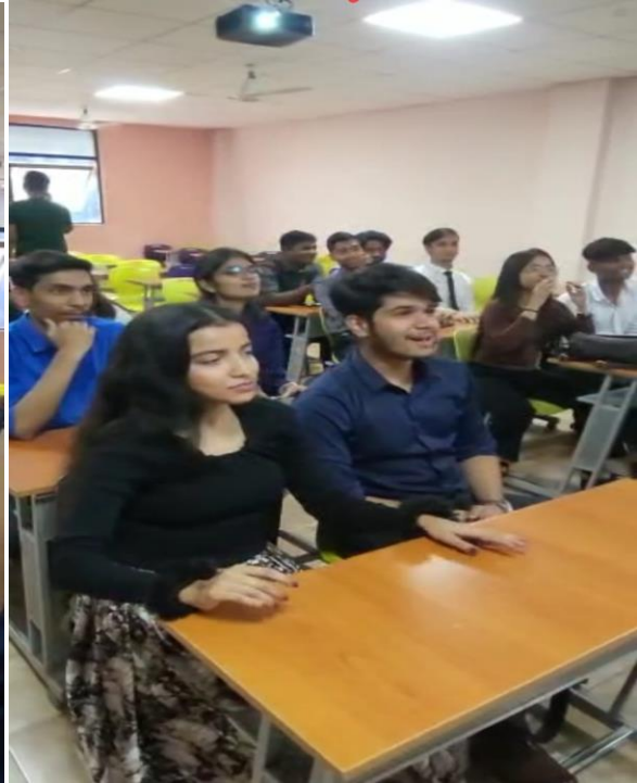
STUDENTS FROM DIFFERENT SECTIONS AND COMBINATIONS PARTICIPATING THE FIRST ROUND OF THE EVENTS