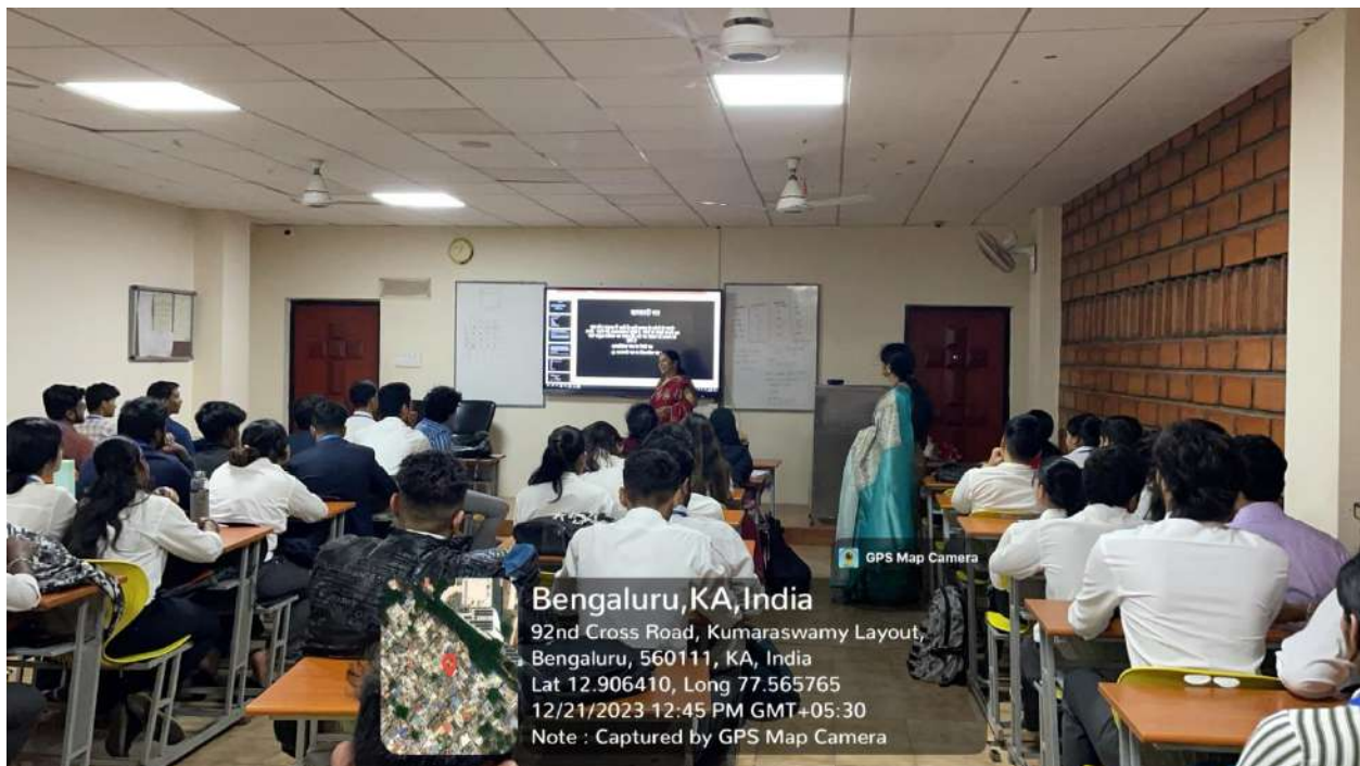
GUEST FACULTY EXPLANATION IN THE CURRENT SESSION