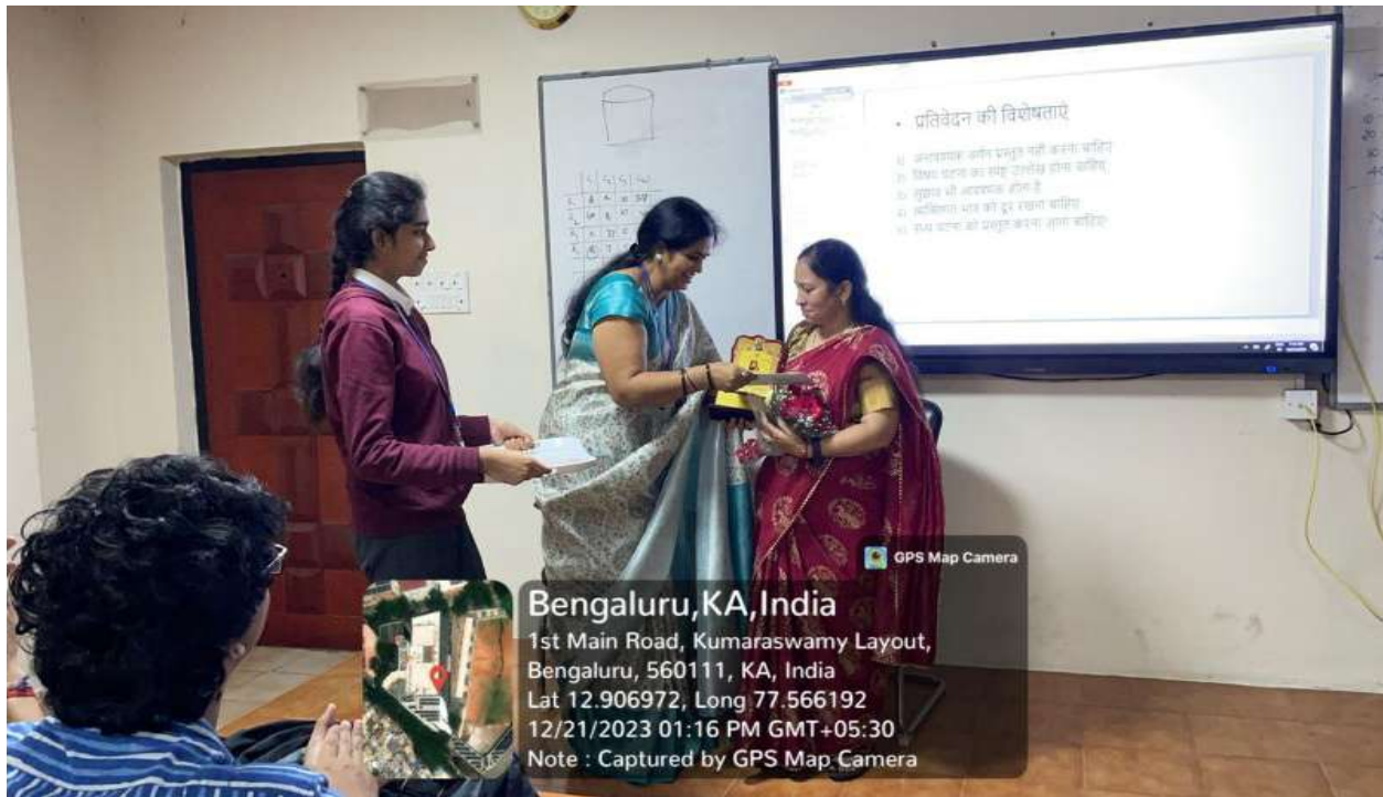
APPRECIATION AND AWARD TO THE GUEST FACULTY