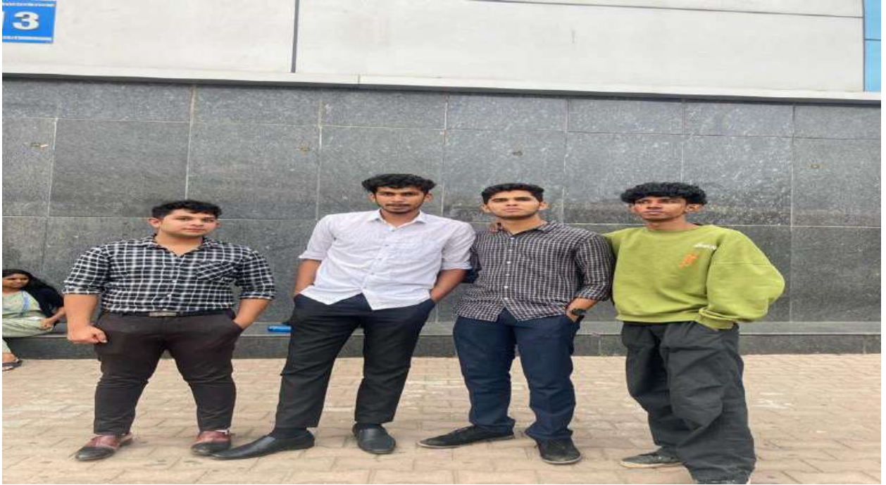
B.COM 1 ST SEM STUDENTS – TEAM NO -4