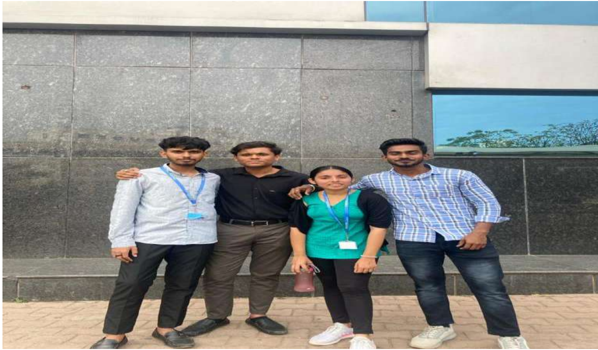
B.COM 1 ST SEM STUDENTS – TEAM NO -2