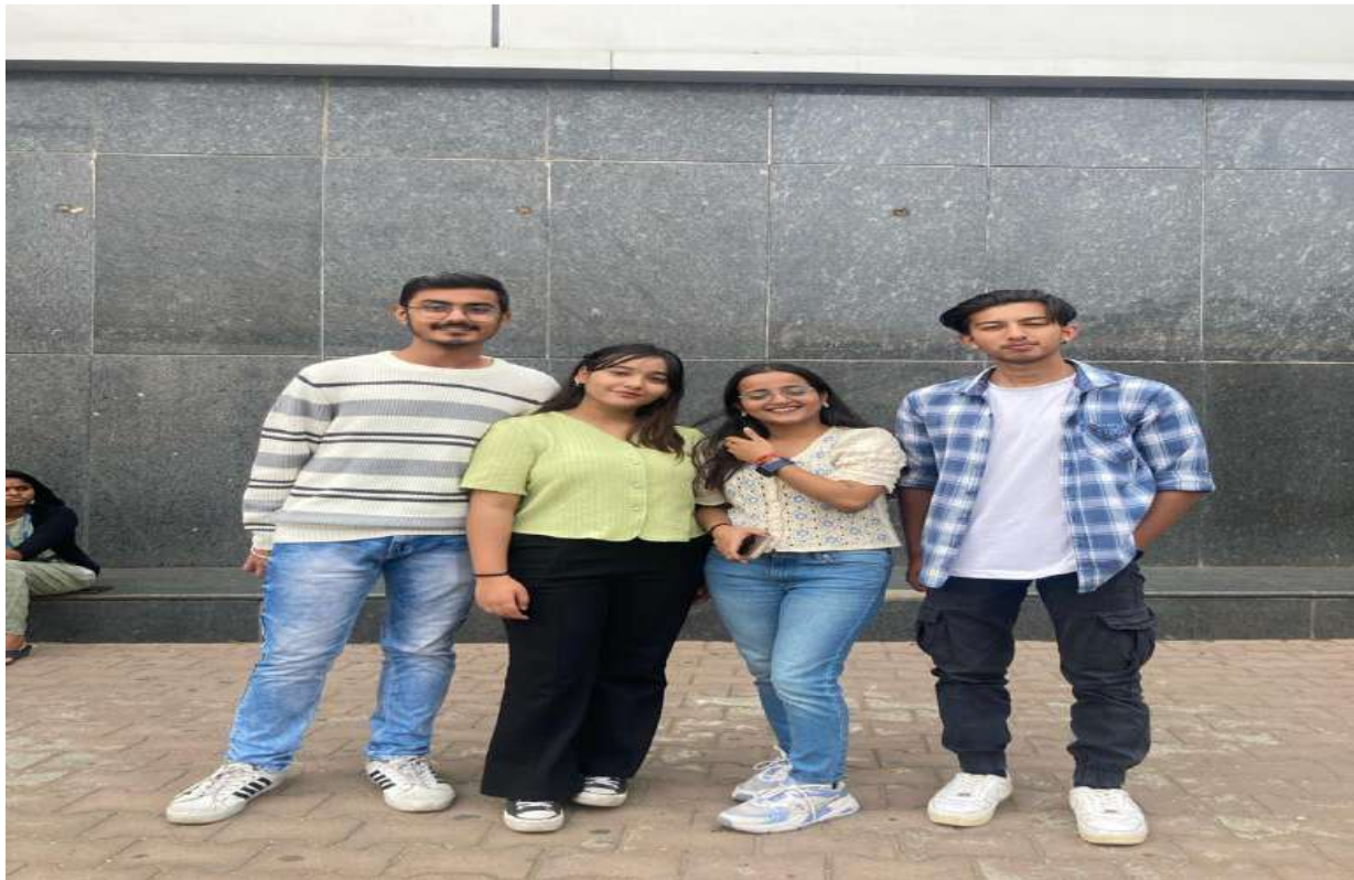
B.COM BBA 3 RD SEM STUDENTS – TEAM NO -3