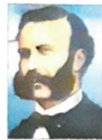
Jean Henry Dunant Founder of Red Cross 1828-1910