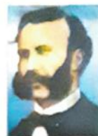
Jean Henry Dunant founder of the Red Cross 1828 - 1910

Karnataka Red Cross, Blood Bank - 080-22268435